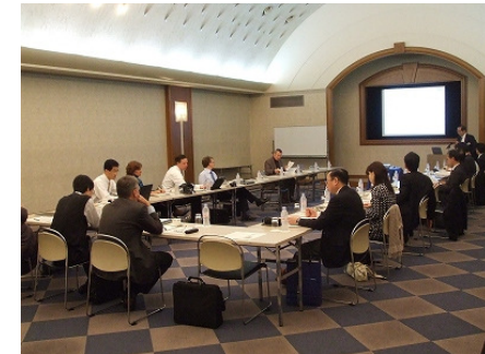
CPO Meeting in April