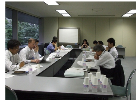
2 nd meeting on July 3