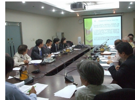
Issue Group meeting in Taipei on July 10.