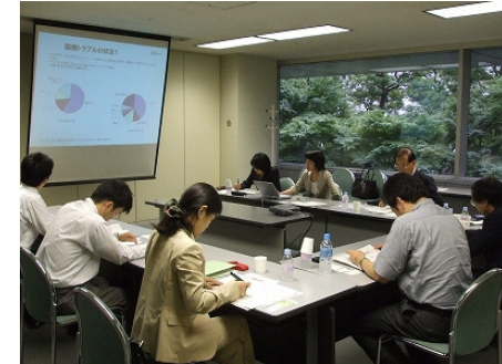
1 st meeting on June 22.